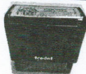
Self-inking Trodat 4912-4913